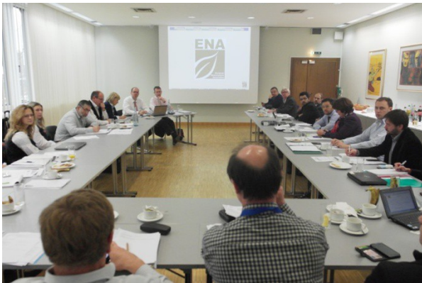
The ENA General Assembly meeting of 29 January 2015.